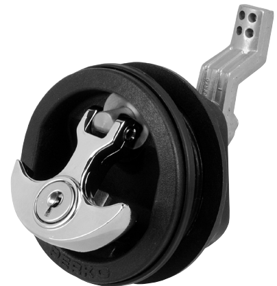
Fig 1086 Draw-Down Lock